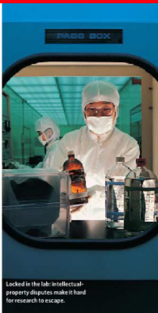
Locked in the lab: intellectual-property disputes make it hard for research to escape.

unable to license," she adds. Industry analysts point out that the growth in the flow of industry research dollars into universities has slowed and become more volatile in the past five years (see graph).